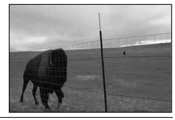
New Fencing goes in!