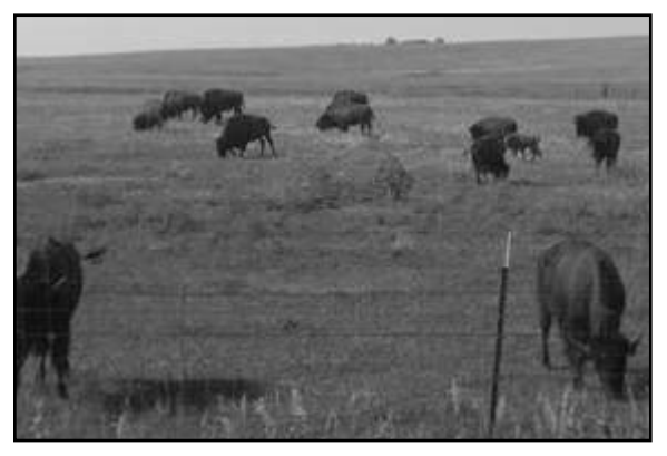
Old Fencing goes out...

We have now changed our fencing to field fencing. With the help of the tractor and implement, it is very easy to install, however a little pricey. So far we have not had a breakout..... yet!