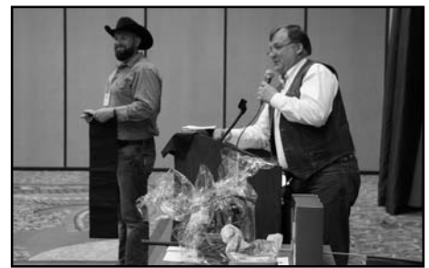
Continued on page 3